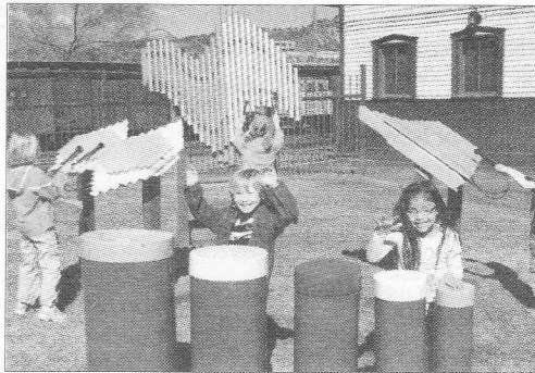
A PARK FULL OF MUSICAL "INSTRUMENTS"

The Rotary Club of Evergreen meets Fridays at 7 am at the Evergreen Country Day School, 1093 Swede Gulch Road. See more at evergreenrotary.org .